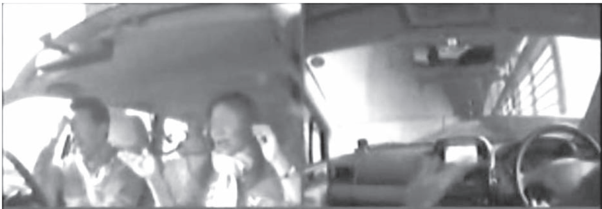
Fig. 1 Monitors during the driving trip

The method to study the thoughtful information provision in driving involves setting the scenario of taking a trip to an unknown destination and training (or nurturing) the elite monitor. This is called the scenario-oriented CCE. In contrast, the approach involving the observation of people in their daily situations without a scenario is called the non-scenario oriented CCE. As an example, we describe the application to the study of spectator behavior at a baseball game.