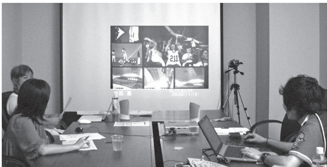
Fig. 2 Interview to baseball fans after game watching at the stadium

From this survey, the stages of the fan were categorized into the following three: pre-fan who “knows/doesn’t know baseball but is not interested in professional baseball games”, fan who “has become fond of the team and goes to watch the game at the stadium”, and the repeater who “goes to the games enthusiastically, has his/her own watching style, and consciously makes time to go to the games” (Fig. 3). The motives that were given for shifting from pre-fan to fan included the introduction of a star player, the expectation for league victory, and the amazement at the cheering fans at the game that one happened to attend. The motives for shifting from fan to repeater were the sense of unity with the other spectators at the stadium that does not get communicated through TV, the accumulation of detailed knowledge about the players, and the acquisition of companions such as family or friends with whom one can watch the games together. There were several paths for the shifts, and there were cases whereby “the person who did not know anything