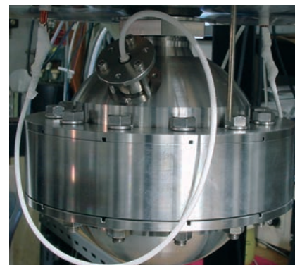
The apparatus for acoustic resonance measurement with a spherical cavity, which enables accurate speed-of-sound measurement for gas samples

Sound waves can be used for measurement of thermophysical properties for fluids. The author developed apparatuses for acoustic resonance measurement with a spherical and a cylindrical cavity to measure thermophysical properties of gas samples. In the spherical cavity, acoustic resonance frequencies can be accurately measured so that speed-of-sound of gas samples can be also accurately determined. Speed-of-sound is one of the thermodynamic properties related to density and compressibility, and is useful information to develop the thermodynamic equations of state for fluids. Recently, the author measured speed-of-sound for refrigerants with very low global warming potential, contributing to the development of the equations of state for them which are required to evaluate the cycle performance of the air-conditioning system. On the other hand, the half-width of acoustic resonances can be accurately measured using the cylindrical cavity, leading to obtain viscosity and thermal conductivity of gas samples. In the future, the author plans to accurately measure speed-of-sound of mono-atomic gas samples to derive the thermodynamic temperature, and reevaluate the international temperature scale (ITS-90).