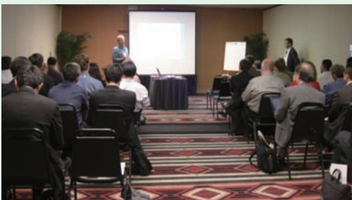
General meeting of the workshop