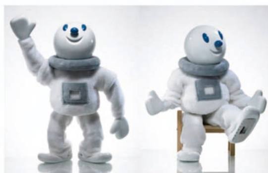
Assistant Robot "TAIZO"

We have developed an assistant robot "TAIZO" for rehabilitation exercises for seniors that is a set of exercises to help rehabilitation of the elderly with some disability. TAIZO is 70 cm tall and has 26 degrees of freedom with a familiar appearance, and can be operated easily by a senior instructor of the exercises through speech recognition and a remote controller. TAIZO can execute about thirty kinds of the exercises and talk with the instructor and the elderly. The robot has been applied to help the instructor of the exercises, and it has been observed that the robot can increase the motivation of seniors to learn the exercises.