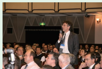
Comments from a participant