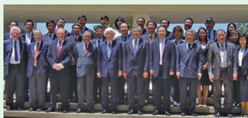
Members of the NSTDA International Advisory Board