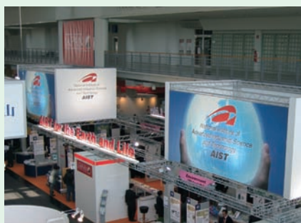
AIST booth at Hannover Messe 2008

During the fair, over 4,000 people visited the AIST booth, and there were over 400 technological consultations, and around 20 business negotiations concerning purchase of development devices and agency contracts.