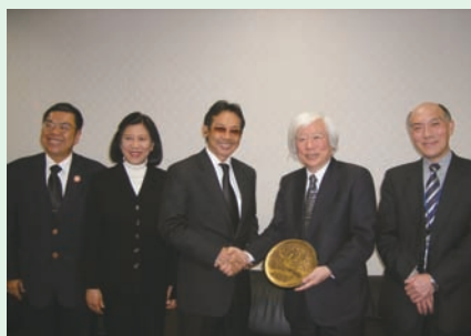
Minister Wutipong, President Yoshikawa, Vice-President Yamazaki and others (Tokyo Headquarters)

This AIST visit by Minister Wutipong was very significant in maintaining the relations of research cooperation between the two countries.