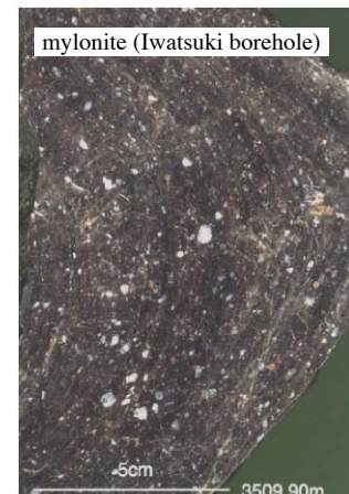
Figure : Photograph of polished slab of the mylonitic rock obtained from 3500m-deep Iwatsuki borehole.

Concealed Median Tectonic Line (MTL), the largest fault in Japan, was confirmed in the Kanto Plain. Geologic analyses for core samples obtained from 3500m deep bore hole of the Iwatsuki Observation Well show that MTL runs within 500m south of the Iwatsuki well. As MTL partially reactivates as active faults especially in Southwest Japan, the relation between MTL and surface Ayasegawa Active Fault should be clarified, and earthquake disaster prevention should be planned based on the relation.