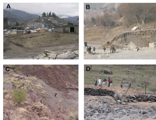
Figure 2: Photographs of surface faulting. A: Tilting of ground in the town of Batakot. B, C and D: 2-5.5 m high fault scarps across river beds.

Yasuo Awata Active Fault Research Center