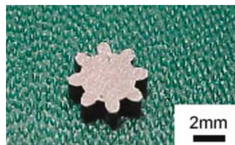
External appearance of bulk amorphous magnesium gear

to fabricate a bulk amorphous magnesium alloy with a commercial part of gear.