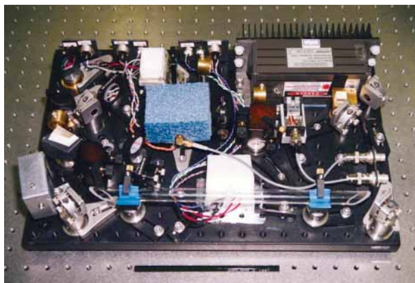
A transportable iodine-stabilized Nd:YAG laser realized at AIST

has been transported to several metrological institutes for international frequency comparison. We have also established an optical fiber network to transfer the realized optical frequency standard.