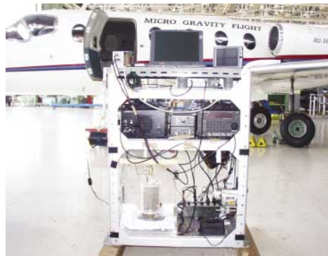
Picture of the experimental set up for water

ity of sound has a strong temperature dependency.