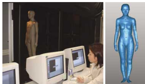
Whole body scanner and scanned data

conducting anthropometric research of 3D body shape and dimensions on 200 senior Japanese with the new scanners. These data will be disclosed to public in June, 2002.