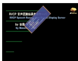
(1) Uttering "utada-."