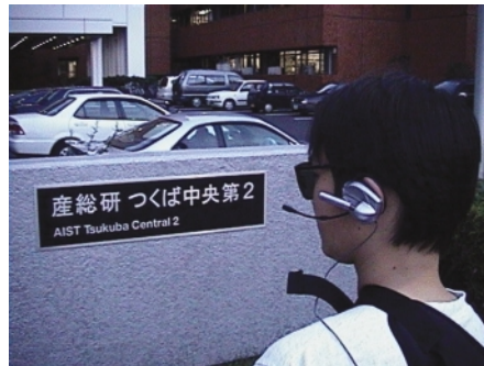
Visually impaired user with an earphone-shaped video camera.

Tele-assistant system for visually impaired people has been developed. The system comprises a wearable video camera (including microphone and earpiece) that can be worn inconspicuously by the visually impaired. It enables information on surroundings, as well as requests from the visually impaired user, to be transmitted to remotely located support helper via a PHS. It enables the visually impaired user to receive audio help whenever and wherever it is needed.