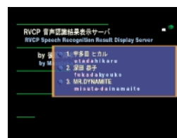
(3) A pop-up window containing completion candidates appears.