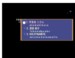
(4) Uttering "No. 1."