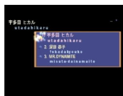
(5) The first candidate is highlighted and bounces.